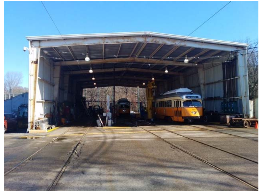
Mattapan car house, Boston