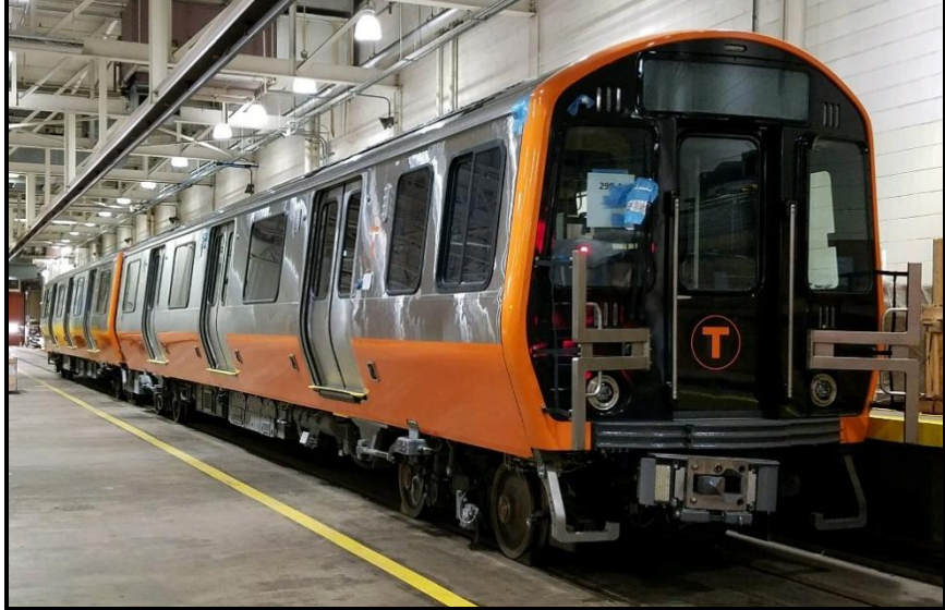
Draft for Discussion & Policy Purposes Only