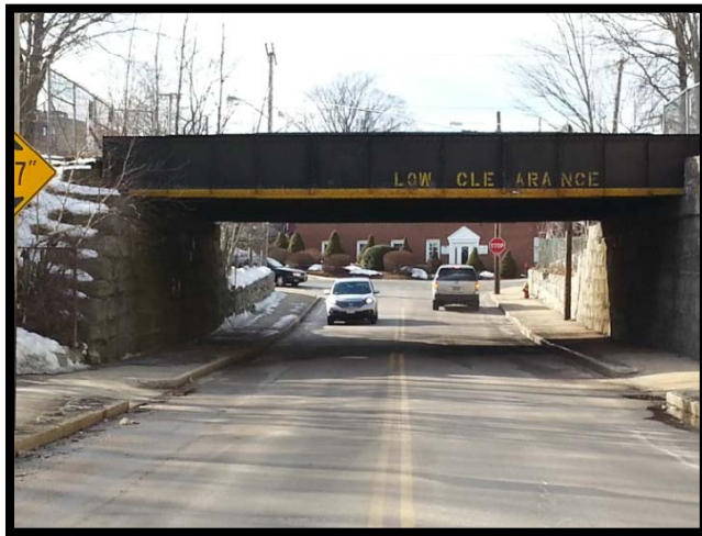
Guild Street Bridge, Norwood, MA - Before