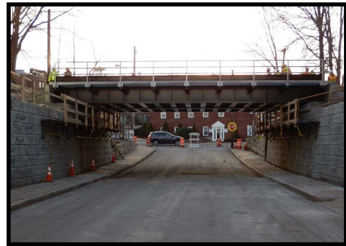
Guild Street Bridge, Norwood, MA -After