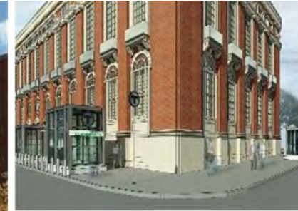
Outbound | Egress Stair, Elevator & Stair at Horticultural Hall