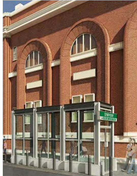
Outbound | New Elevator & Stair at Boston Symphony Orchestra (BSO)