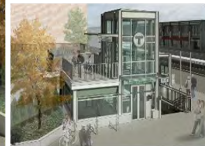
Inbound | Elevator & Stair at Symphony Tower West