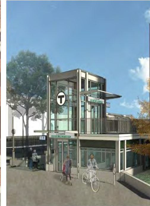
Inbound | Elevator & Stair at Symphony Tower East