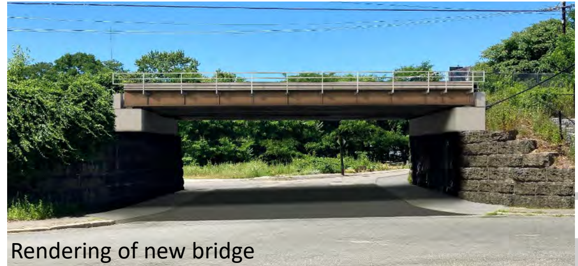
Rendering of new bridge