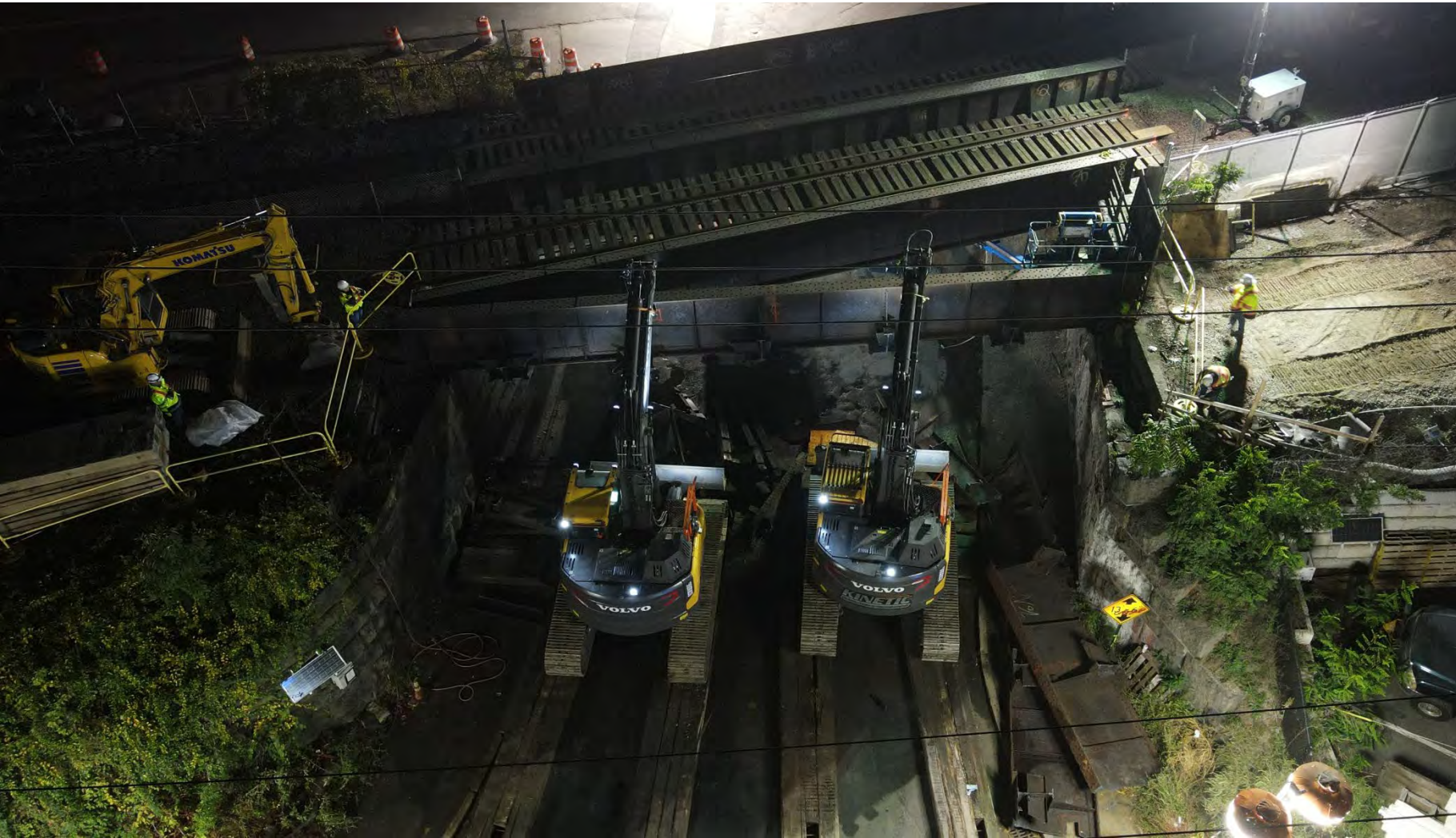
View of demolition of Georgetown Branch Bridge