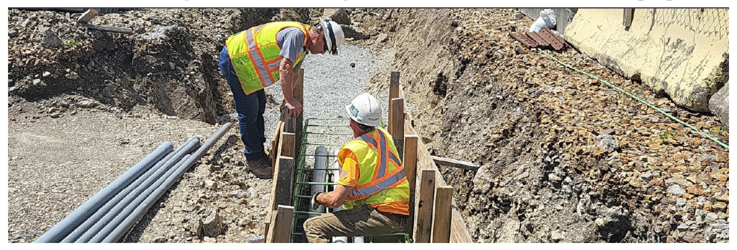
<u>Codman Yard Expansion and Improvements:</u> Upgrade the yard to increase service capacity, replace outdated infrastructure, and enhance safety