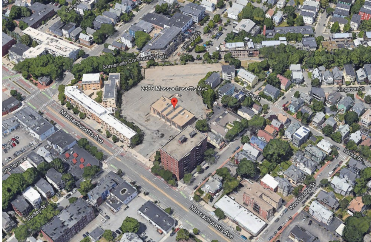
2375 Massachusetts, North Cambridge Ave