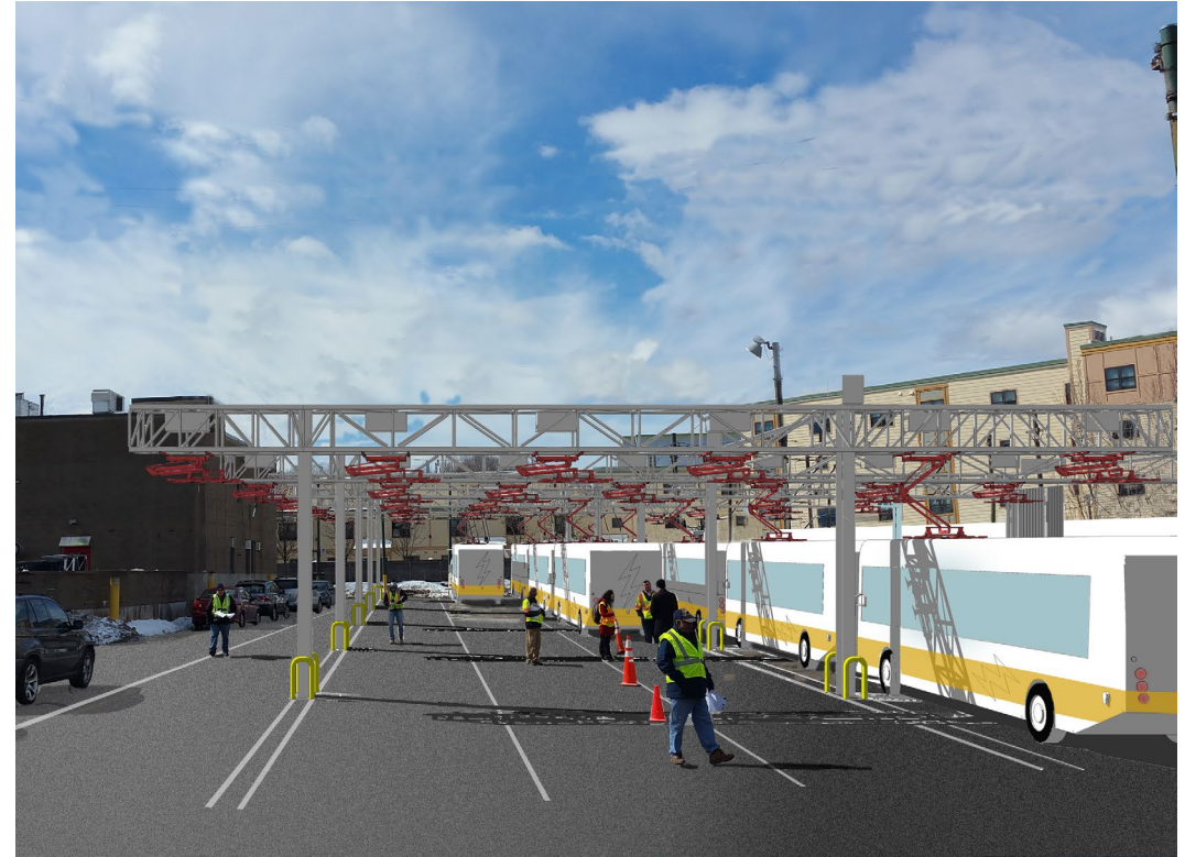
Gantry charging station yard view