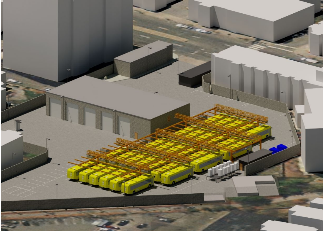
Overhead view of charging yard