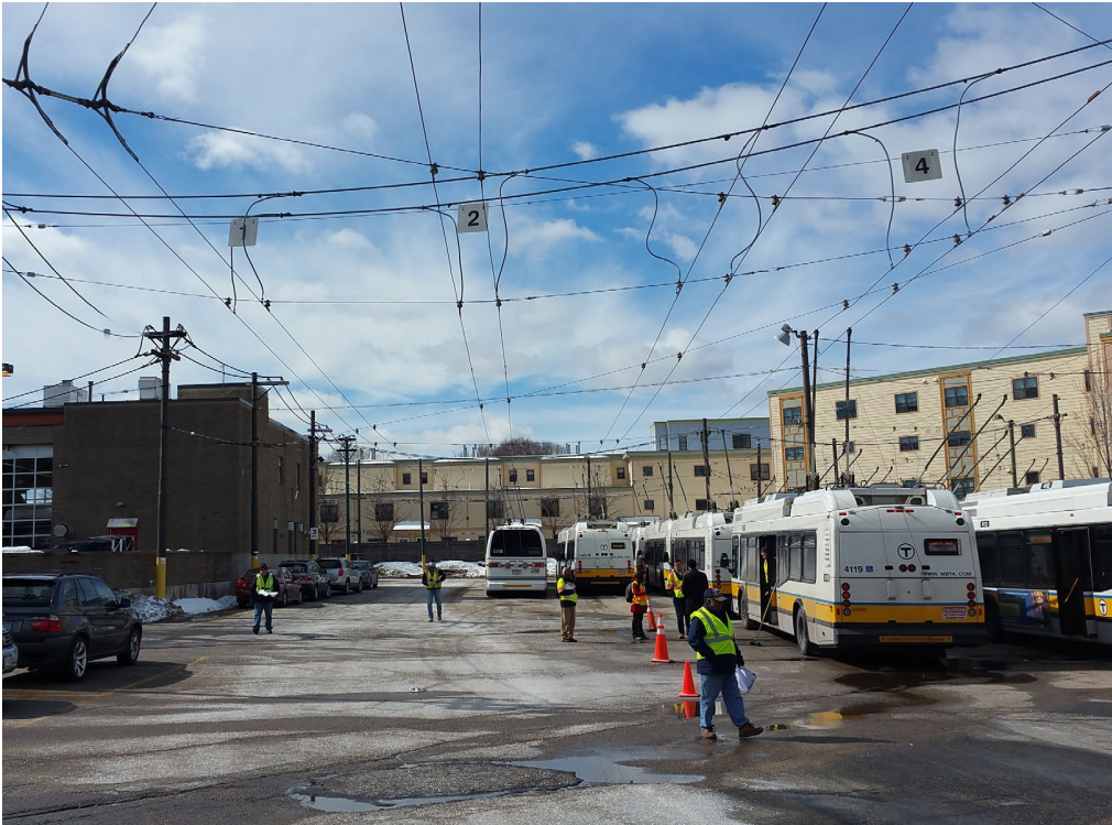
Former Overhead Catenary Bus Facility