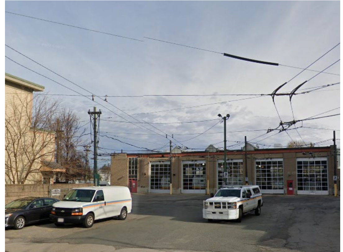
Bus Facility Entrance – Massachusetts Ave