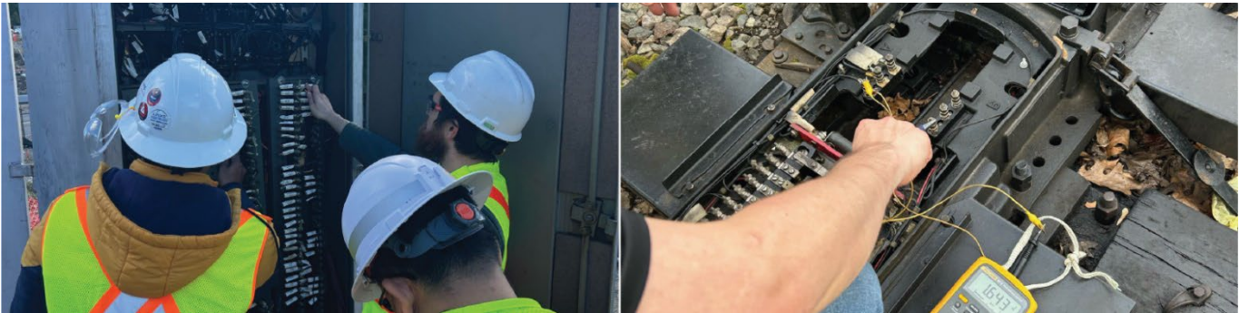
Signals work completed during the Ashmont Branch/Mattapan Line surge

Work continues on the Red Line Transformation (RLT) program. On October 30, the MBTA announced the successful completion of critical track work on the Red Line's Ashmont Branch and the Mattapan Line. On behalf of the Capital Transformation Team, we would like to thank the public for their patience as we completed this critical infrastructure work. We encourage riders to review the MBTA's press release on November service changes .