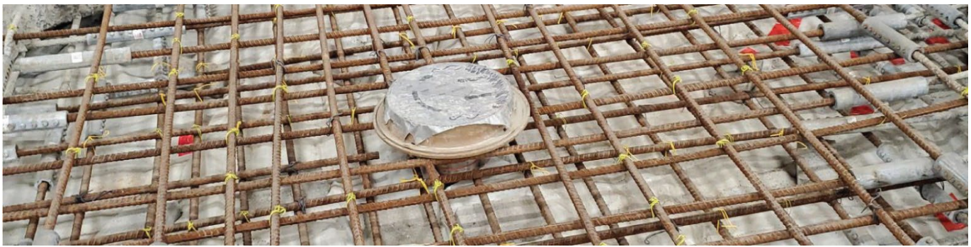
Work on floor drains continues at Wellington Vehicle Maintenance Facility

Progress continues on multiple projects under the Orange Line Transformation (OLT) program. Continue reading for more information.