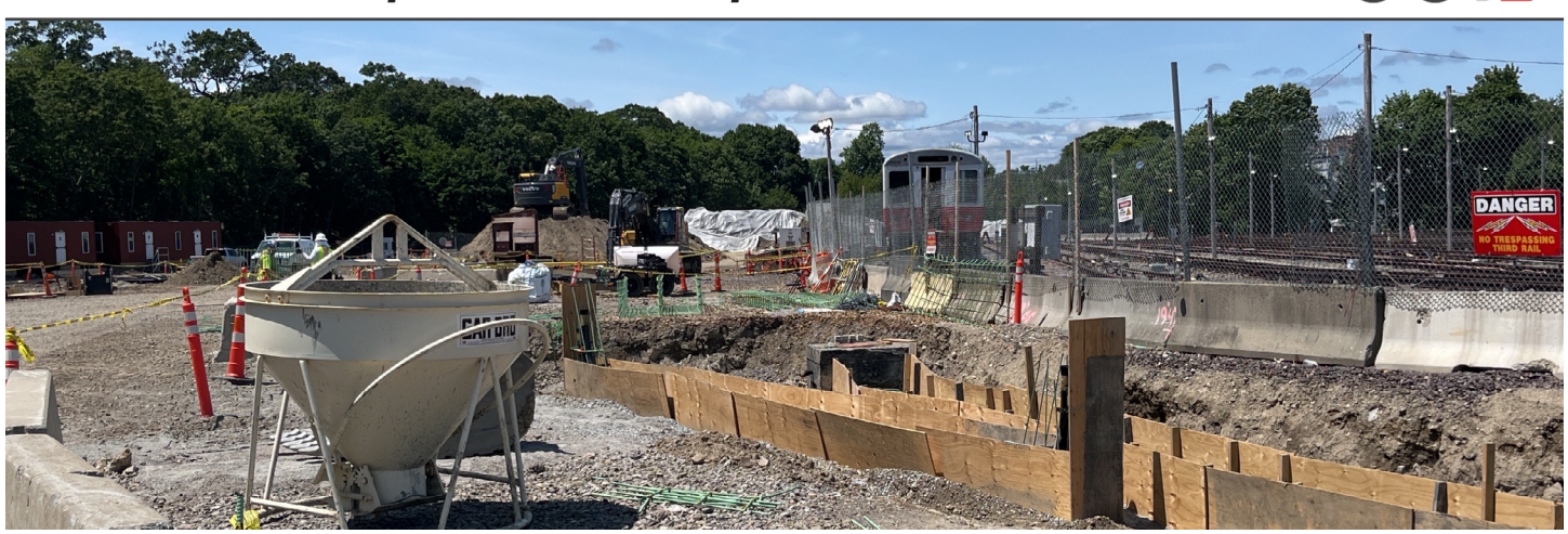
<u>Codman Yard Expansion and Improvements:</u> Upgrade the yard to increase service capacity, replace outdated infrastructure, and enhance safety