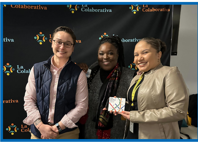
Community Meeting at La Colaborativa in Chelsea on the Service and Fare Change Equity Policy and Updated Public Engagement Plan, 2023

The MBTA is committed to developing policies and procedures to achieve the goals and principles outlined in this PEP. We look forward to the public's continued participation in transit development from planning, design, and construction, to service planning and policy.