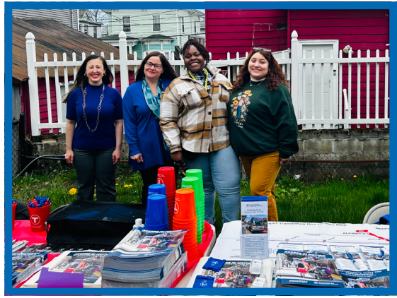
Dorchester Community Resource Fair, 2023