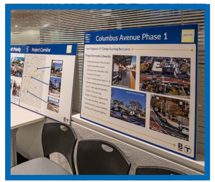
Informational posters at an in person CIP meeting, 2023

Public meetings are conducted during the planning phase in order to relay information to the general public and to solicit input concerning the project. The public meetings serve as forums at which the MBTA can learn about and respond to community concerns. Some projects, particularly those related to system maintenance and asset improvement, may not necessitate public engagement. However, progress on those initiatives should be reported out to the public regularly.