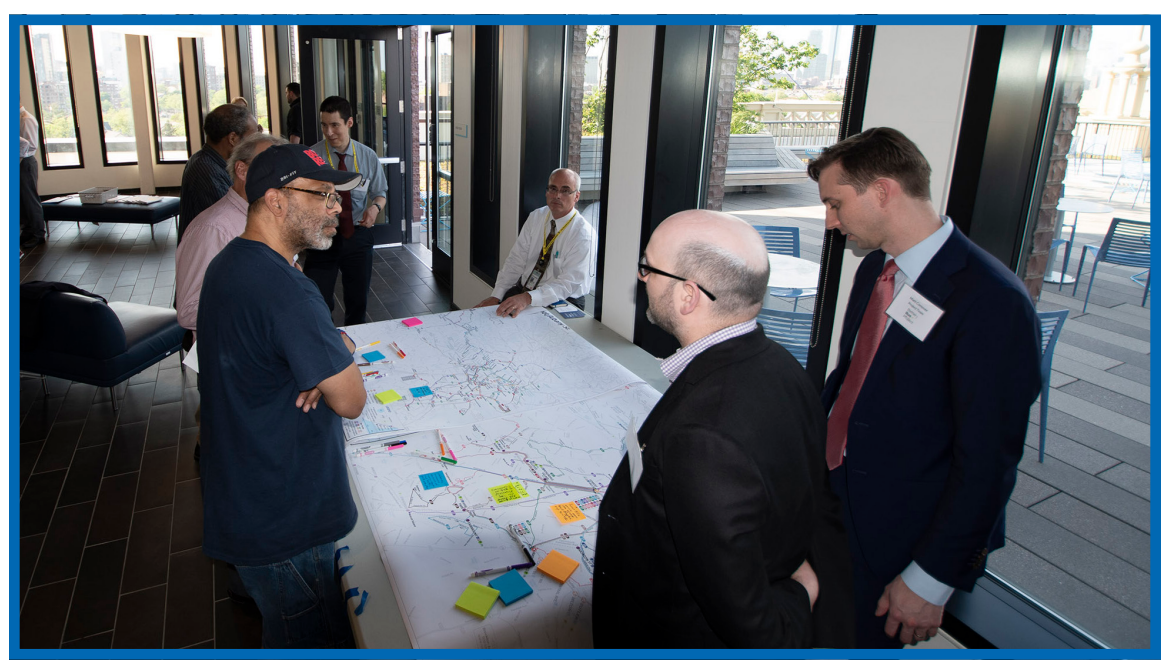
Dudley Better Bus Meeting, 2022