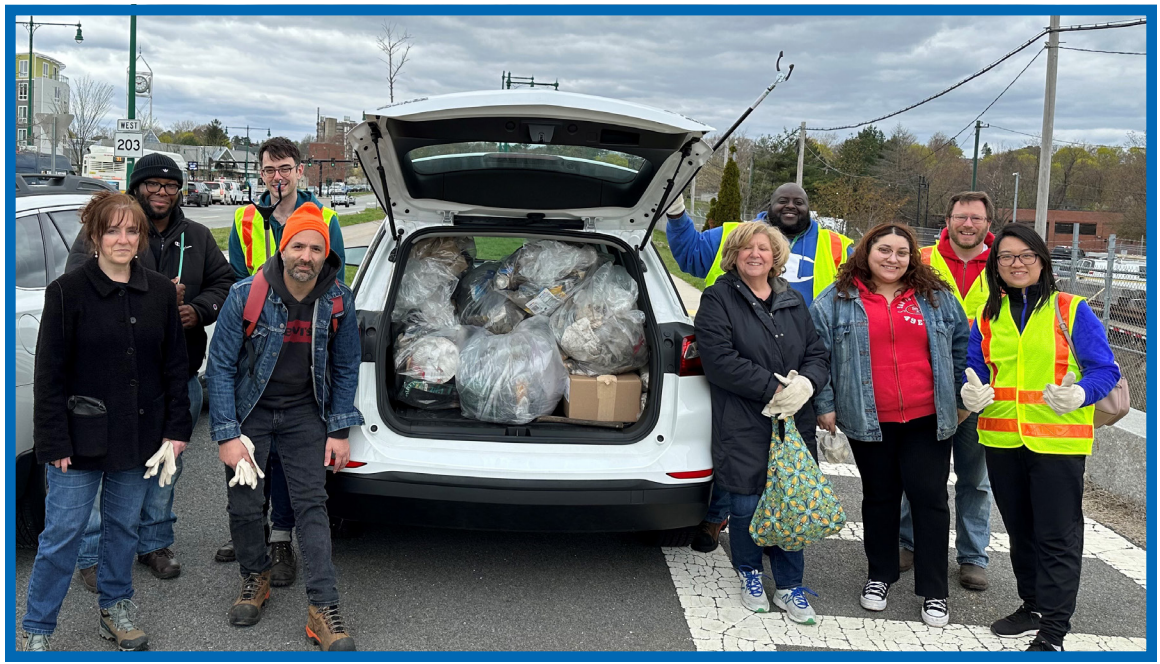
MBTA Forest Hills Station Clean-Up, 2023

Public hearings are a type of public meeting held with more formality and are often required by state or federal law. At a public hearing any community member has an opportunity to provide a formal public comment on the topic at hand. The MBTA records all comments in a written transcript.