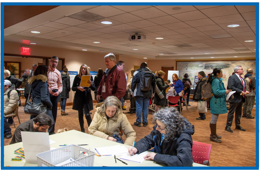
Quincy Center, Thomas Library, Community Meeting 2019

As a public entity serving the needs of the public, the MBTA has a responsibility to be transparent about decisions that impact the public, create multiple channels through which members of the public can provide input, and weigh this input as part of its decision-making process. The MBTA recognizes that this input can lead to the delivery of service and projects that align with the interests of the riding public – a benefit for the Authority and riders in the long-run – which is why this Plan emphasizes hearing from a variety of rider views and different communities within the MBTA service area when making decisions.