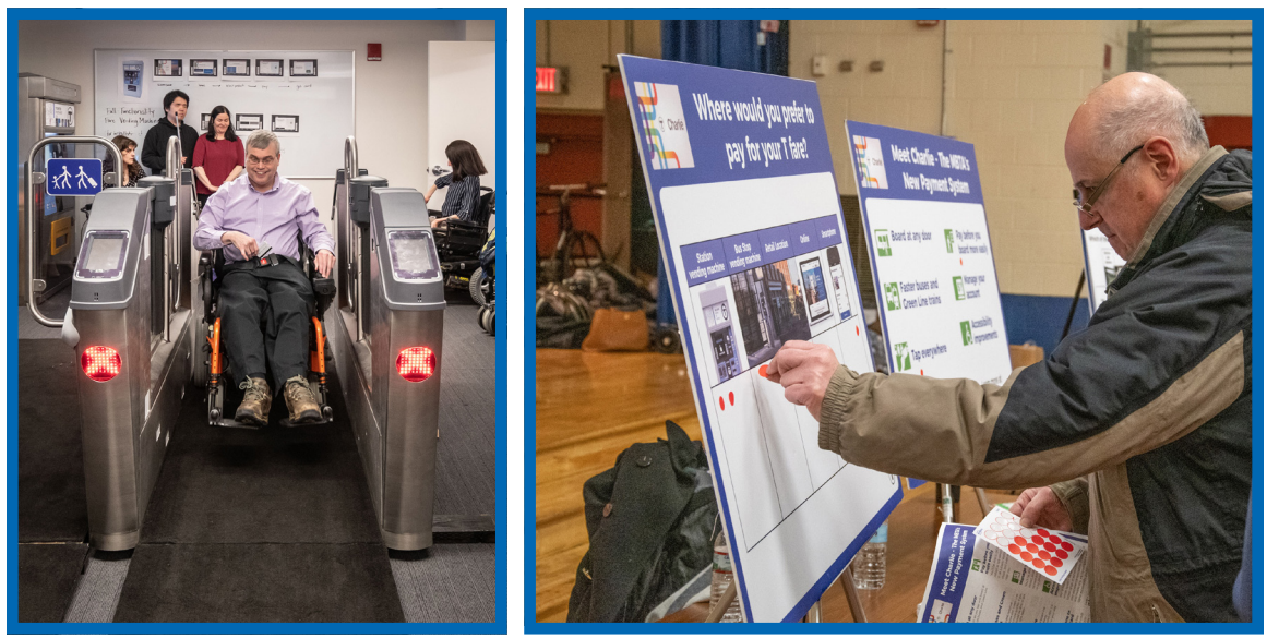
AFC 2.0 Prototype Visit, 2019

Strategic planning for the involvement of communities of color, low-income, disability, and other protected groups is essential to an inclusive and successful effort. Taking steps to overcome barriers to participation increases the representation of