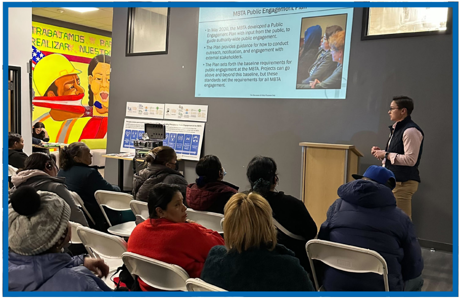
Community Meeting at La Colaborativa on the Service and Fare Change Equity Policy and Updated Public Engagement Plan, 2023

The Massachusetts Bay Transportation Authority (MBTA)<sup>1</sup> believes that engaging the public in the development and improvement of transit infrastructure and planning is critical to responding to the evolving needs of the Commonwealth. We have developed a Public Engagement Plan (PEP or Plan) to detail our commitment to meeting these evolving needs, as well as ensuring the civil rights<sup>2</sup> of members of the public to participate in and influence transportation decisions through accessible and inclusive engagement strategies.