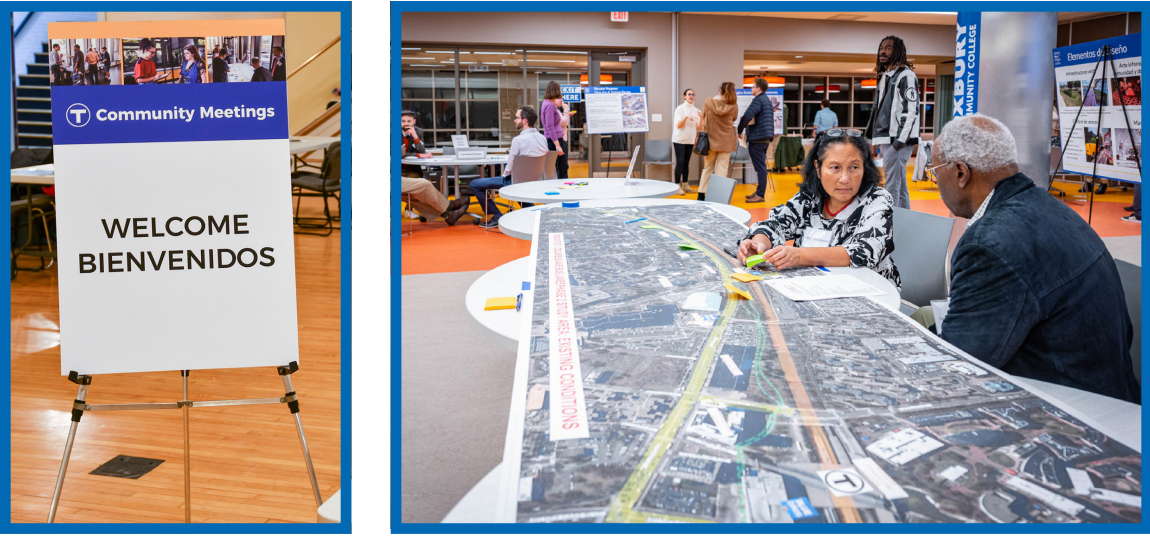
Bus Network Redesign Open House, Columbus Ave, 2022