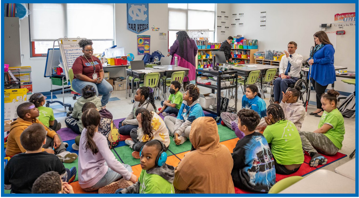
MBTA KIPP Academy School Visit, 2023