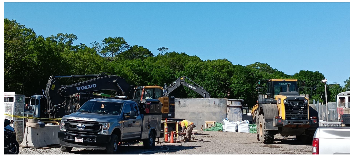
<u>Codman Yard Expansion and Improvements:</u> Upgrade the yard to increase service capacity, replace outdated infrastructure, and enhance safety