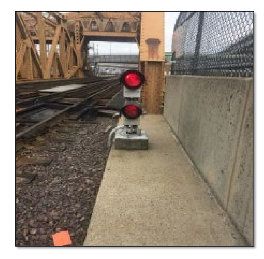
Typical existing signal on Draw One