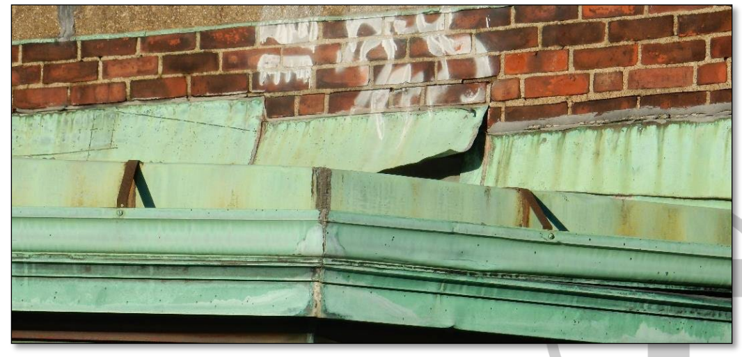
Bent and damaged copper flashing