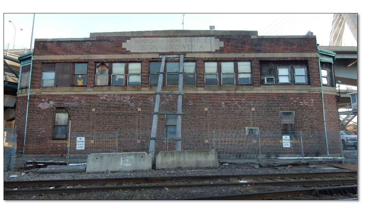
Existing Control Tower A building, currently out of service