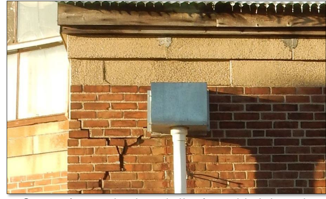
Severely cracked and displaced brickwork