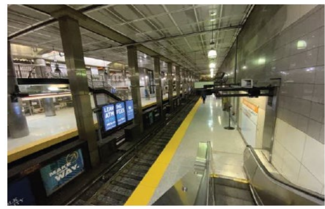
Orange line Outbound Platform and Existing Escalator