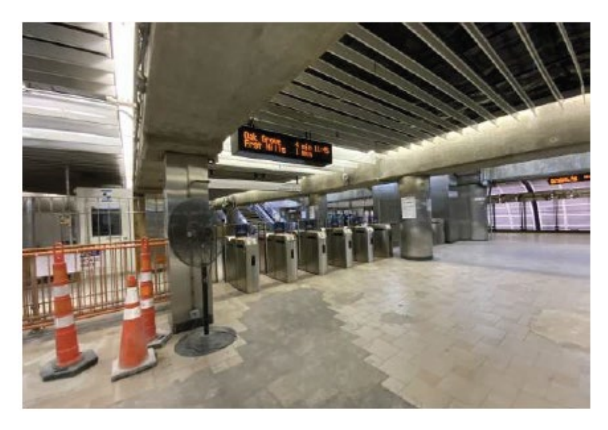
Valenti Way entrance Existing Faregates