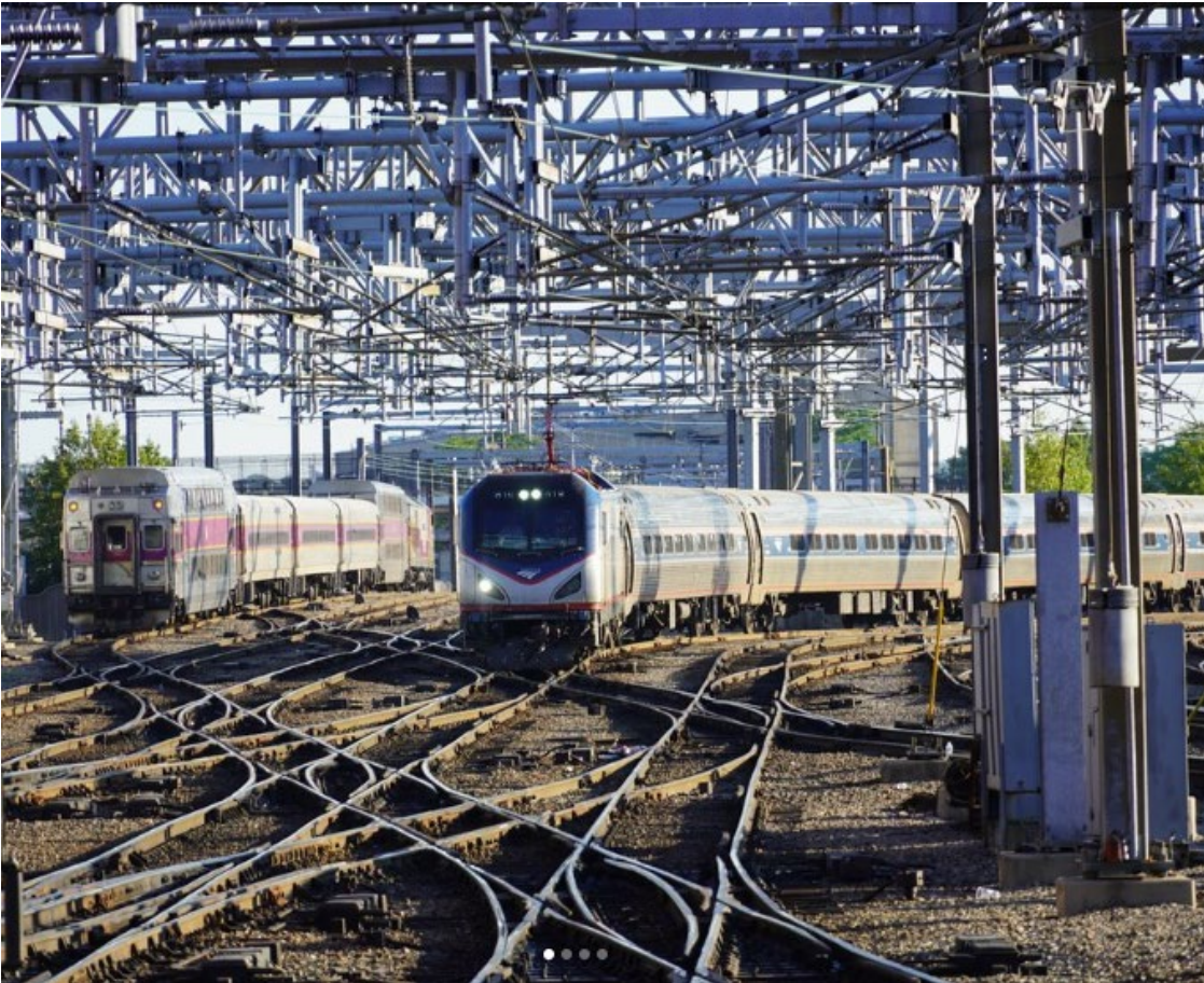
Tower 1 interlocking area