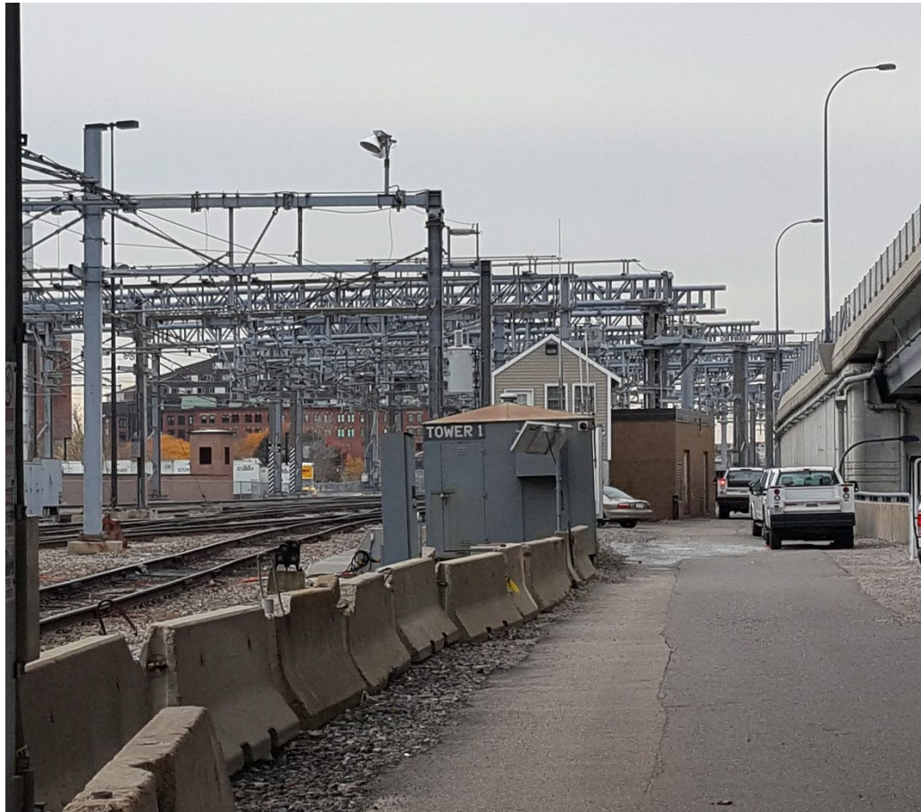
Existing CIH Location & Tracks