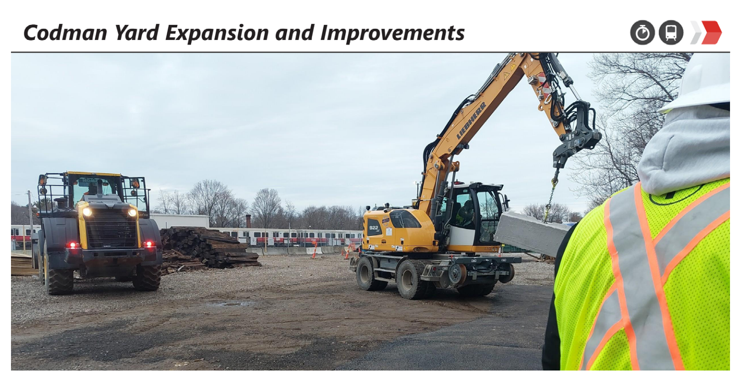
<u>Codman Yard Expansion and Improvements:</u> Upgrade Codman Yard with additional train storage capacity, new inspection pit, and safety and security features