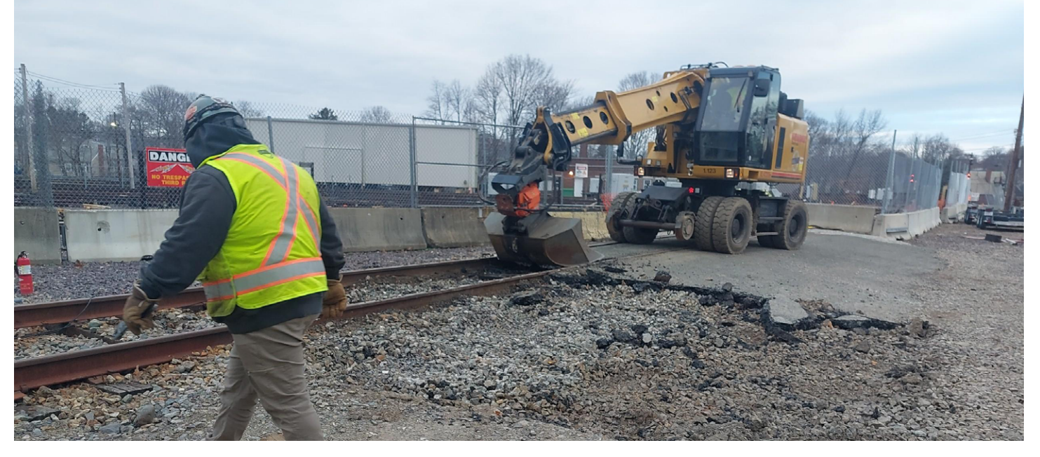
<u>Codman Yard Expansion and Improvements:</u> Upgrade Codman Yard with additional train storage capacity, new inspection pit, and safety and security features