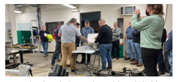
Junction box design review with stakeholders

• A wayside equipment demonstration was held at the Cabot Signaling Training Center on February 23<sup>rd</sup>. Attendees included the Project Team, multiple Stakeholders, FTA, DPU, and System Integrator representatives. A system overview was given including electrical schematics & mechanical drawings then an equipment demonstration was completed to show how a signal, junction box, and balise work together in providing train protection