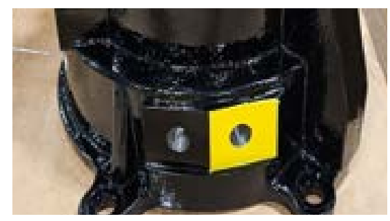
40 newly manufactured speed sensor housings received