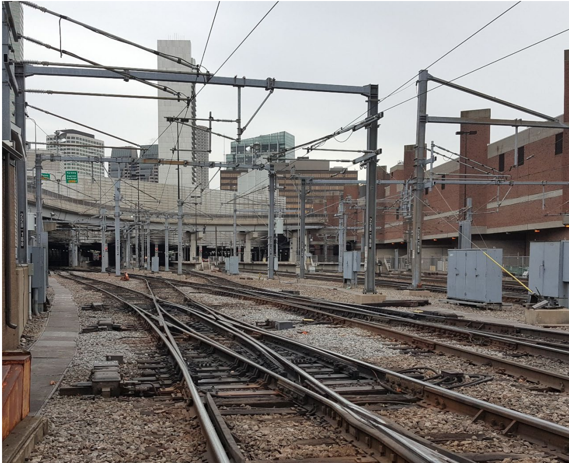
Tower 1 Tracks (North)