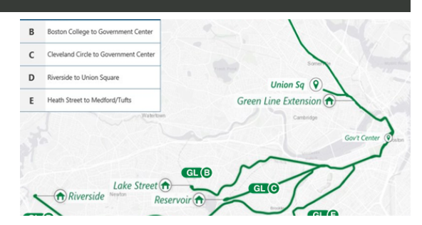
Green Line map outlining surface branches

• Operational integration sequencing will be implemented per a stringent review process which involves a system hazard analysis developed by the System Integrator moving through an Operational Readiness Review to ensure mitigations are in place and all affected personnel are aware and trained on the system before it is turned on. The short-term objective is to reach a mixed fleet of fully protected vehicles accompanied by speed enforced wayside branches per the revised schedule by the end of December 2023. Full activation of GLTPS would be complete by June 2025.