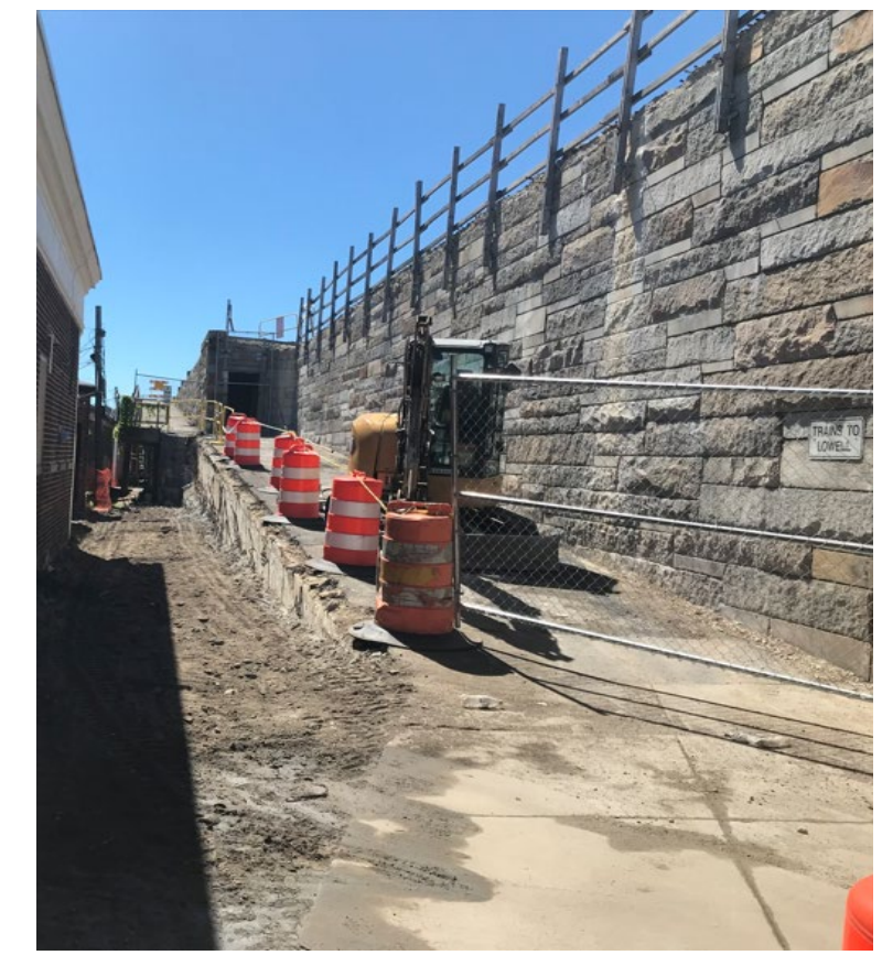
Demolition at Northeast Ramp behind the Thompson Street buildings (September 2022)