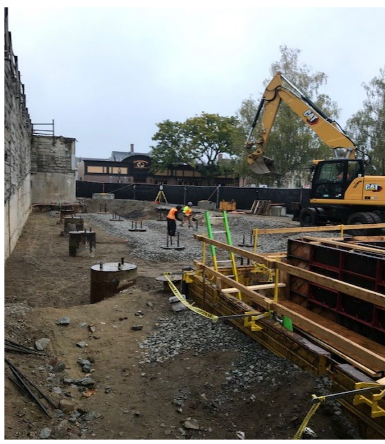
Start of Ramp Foundation at the Aberjona Lot (October 2022)