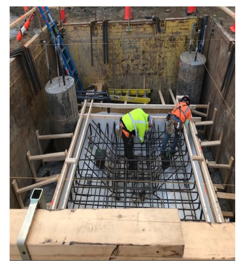
Elevator Foundation at Aberjona Lot (October 2022)