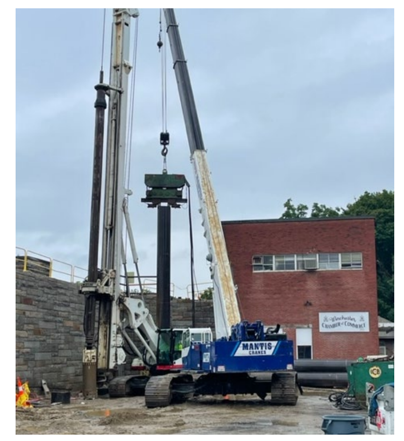
Drilled Shafts for Elevator at the Waterfield Lot (September 2022)