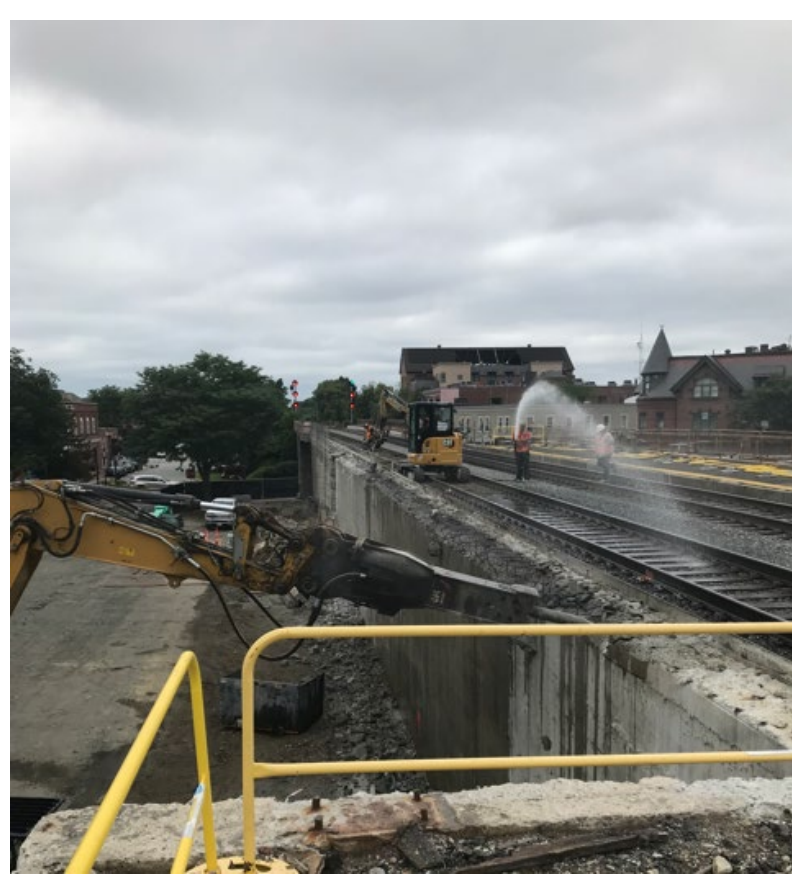
Granite Stone Removed and Demo at Laraway Lot with dust control (August 2022)