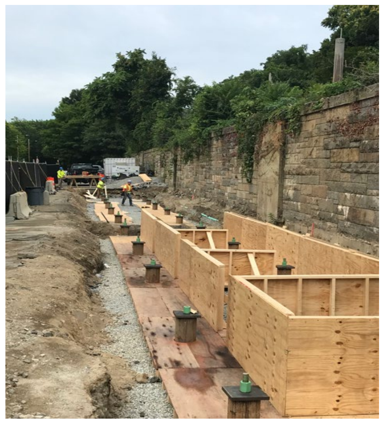
Forming Pile Caps and Grade Beams at Aberjona Lot (August 2022)