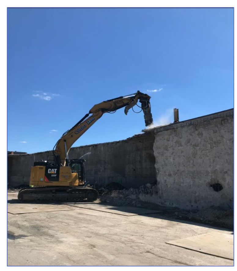
Demolition Work at the Laraway Lot (July 2022)