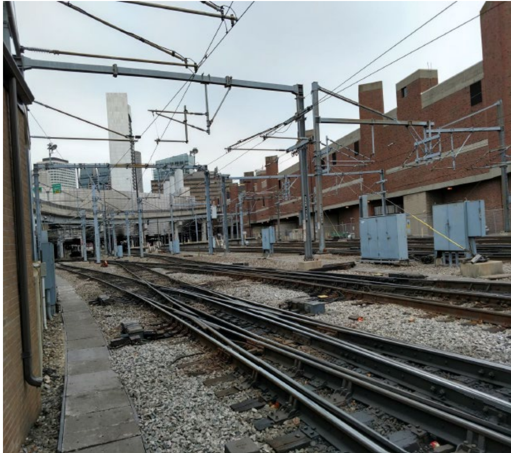
Tower 1 Tracks (North)