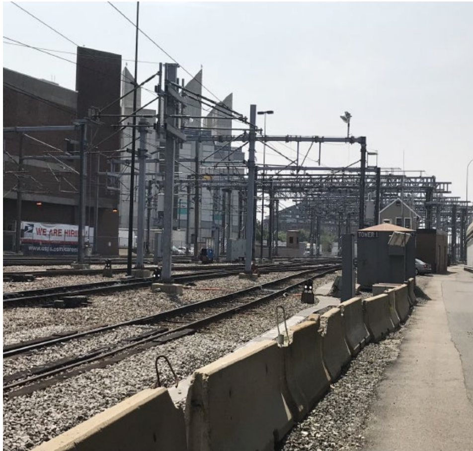
Existing CIH Location & Tracks