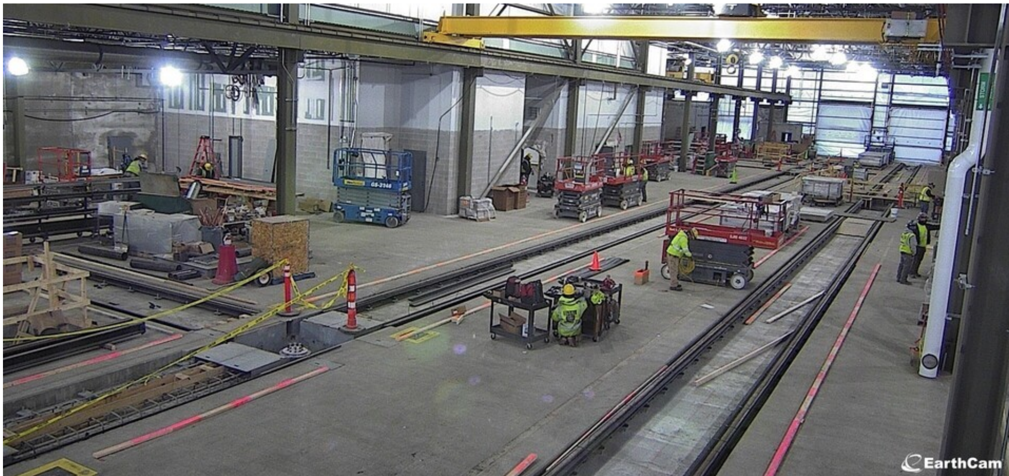
Vehicle Maintenance Facility – February 2021