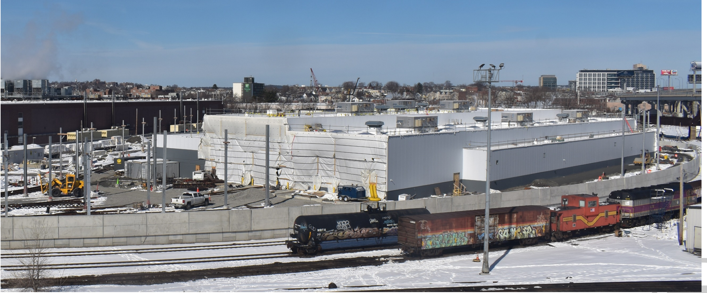
GLX Vehicle Maintenance Facility – February 2021