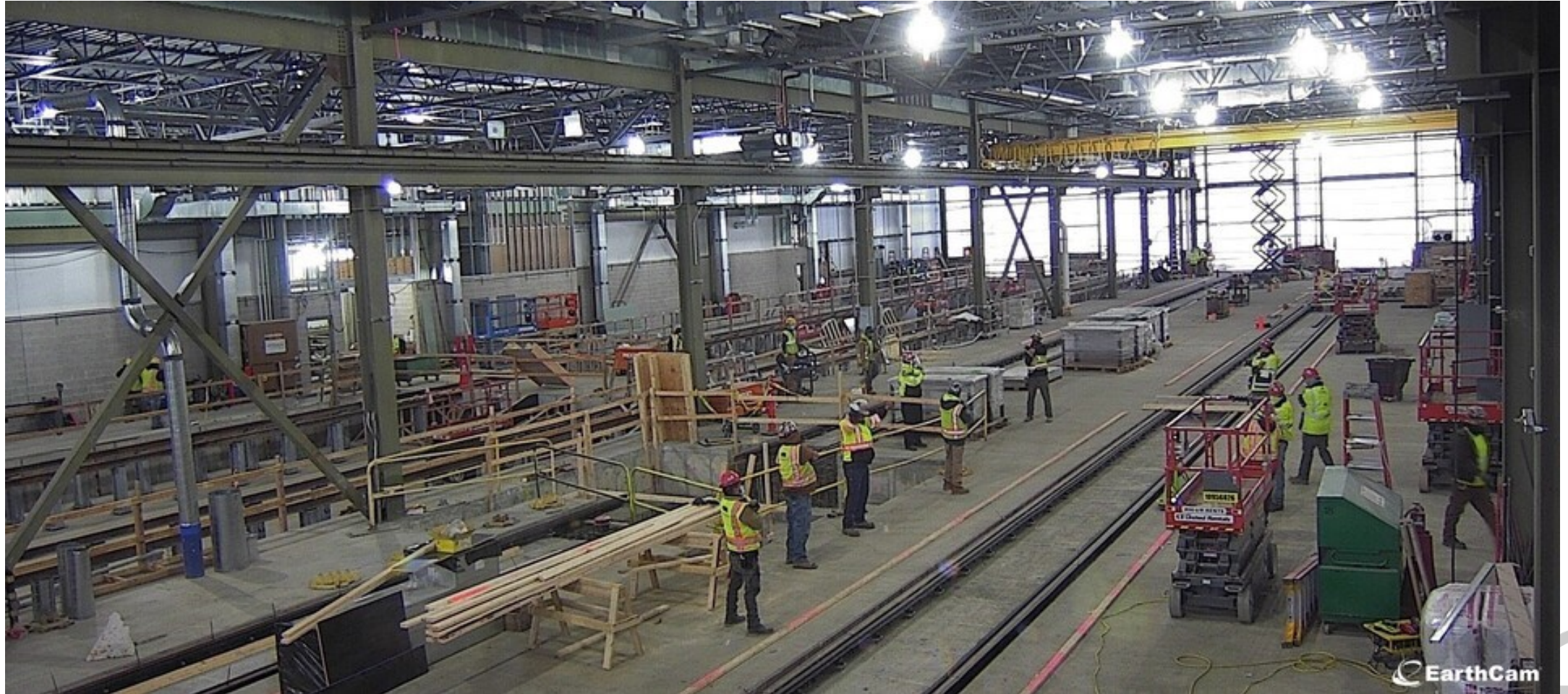
Vehicle Maintenance Facility – February 2021