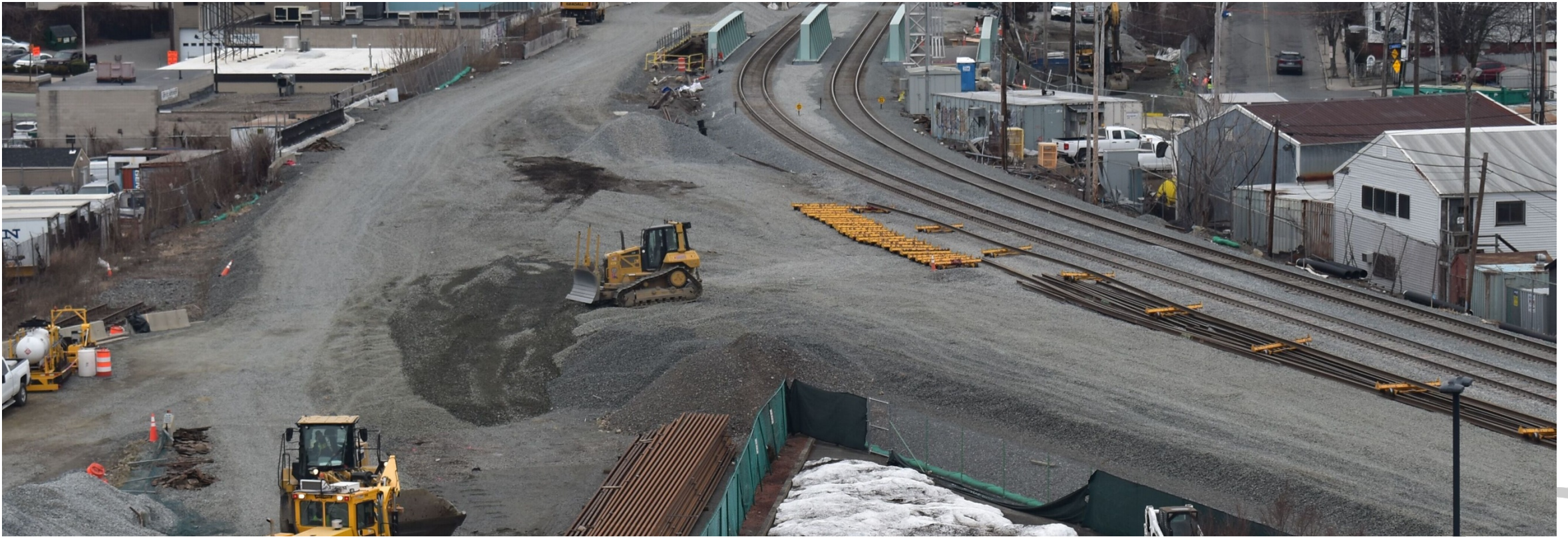
Site of Future East Somerville Station – February 2020