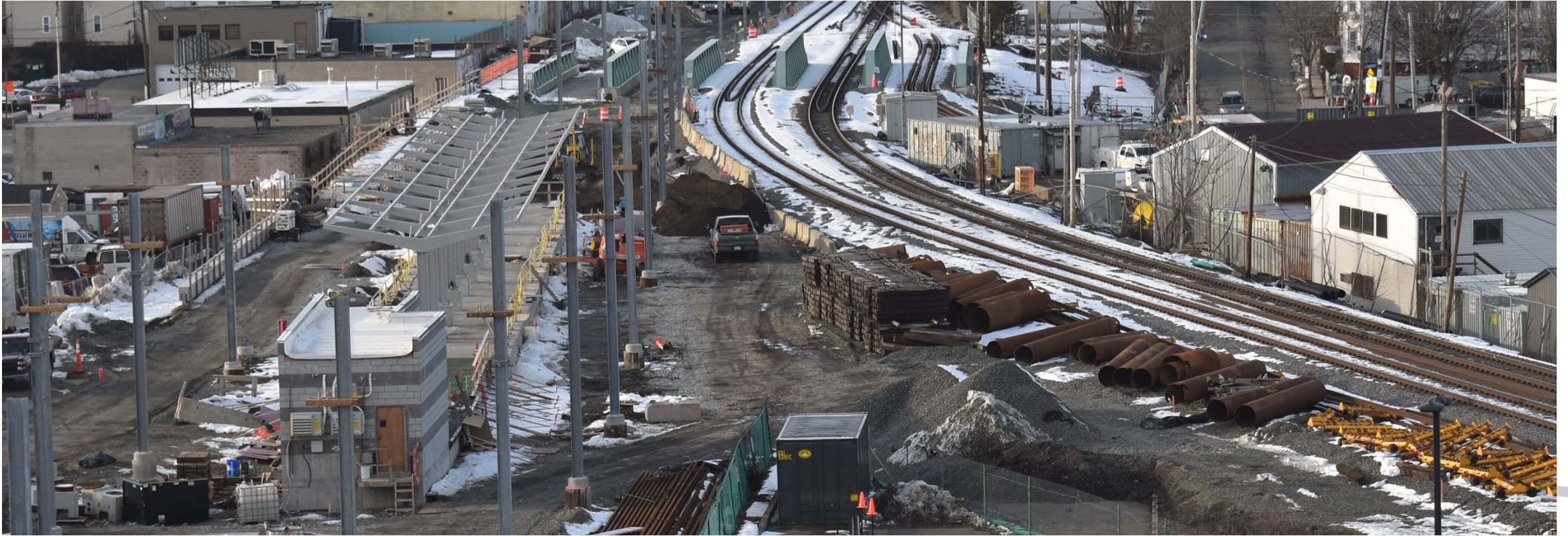
Site of Future East Somerville Station – February 2021