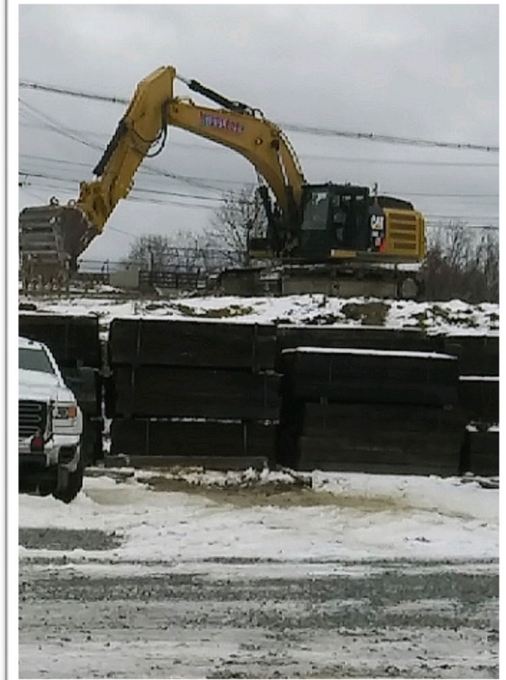
Middleborough Secondary/New Bedford Mainline/Signals (K78CN04)