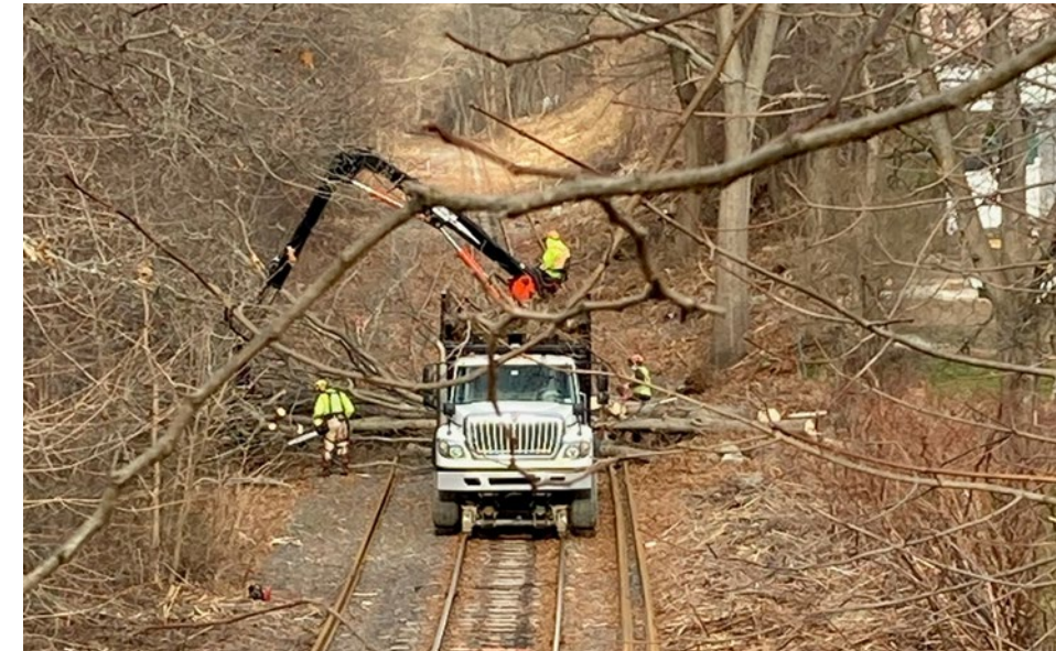
Cook Forest Products clearing south of Fall River Country Club