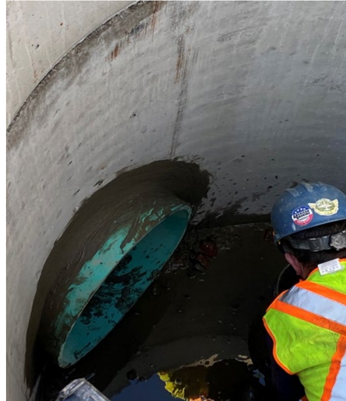
S/DWW sealing pipe penetrations & installing inverts in structures (Mother Brook Sewer)