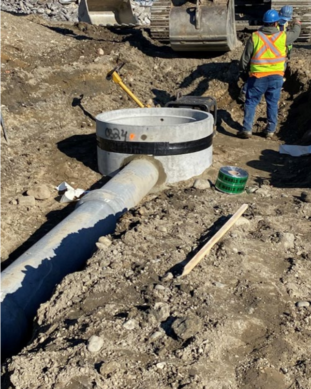
S/DWW installed drainage piping & structures (Weaver's Cove)

South Coast Rail Project Website: www.mass.gov/southcoastrail