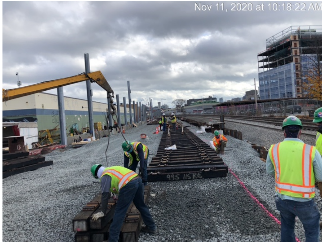
Union Square Branch