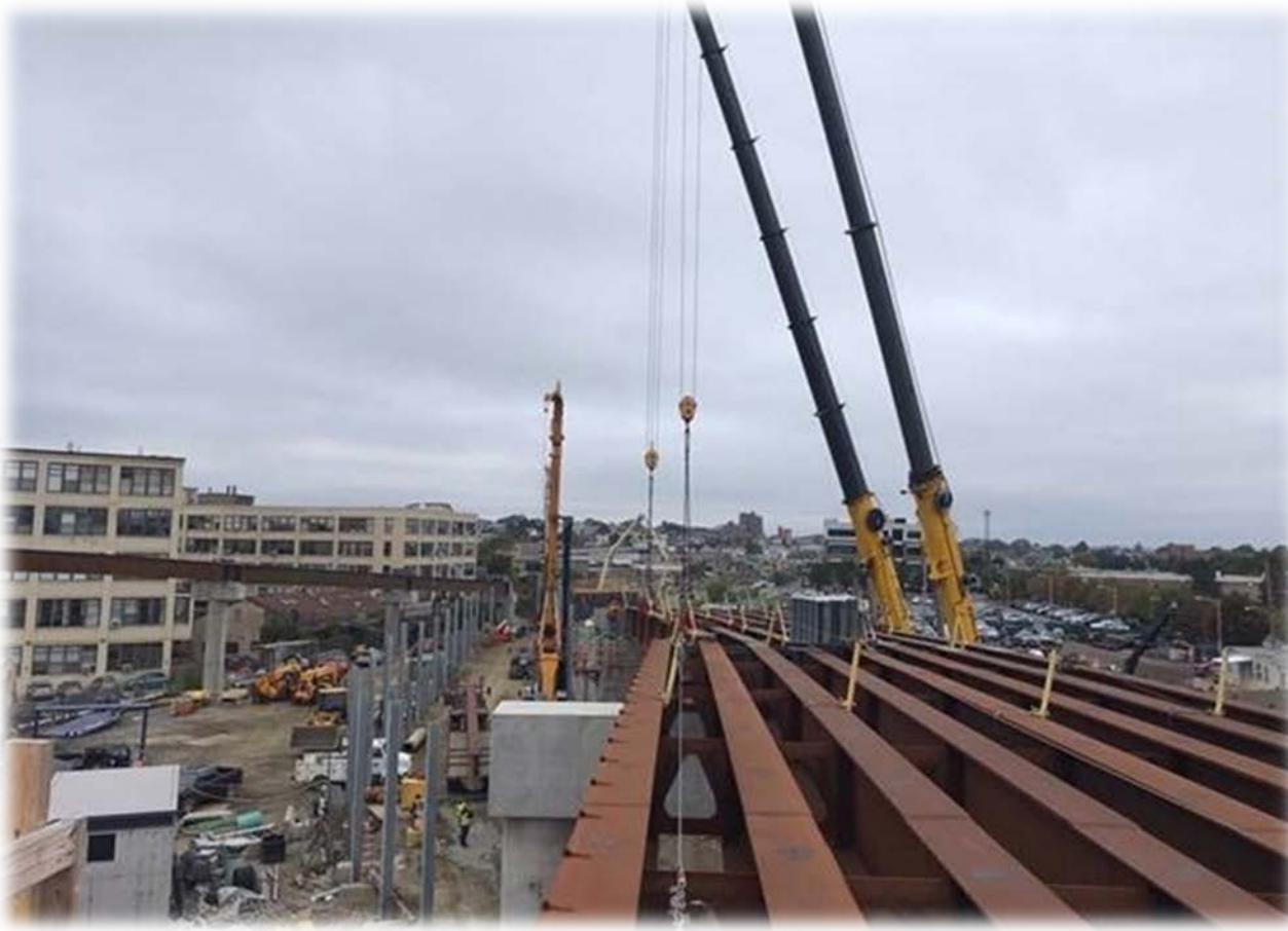
Final Span of viaduct structural steel