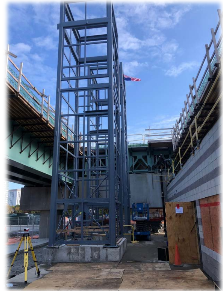
Elevator Tower at Lechmere Station