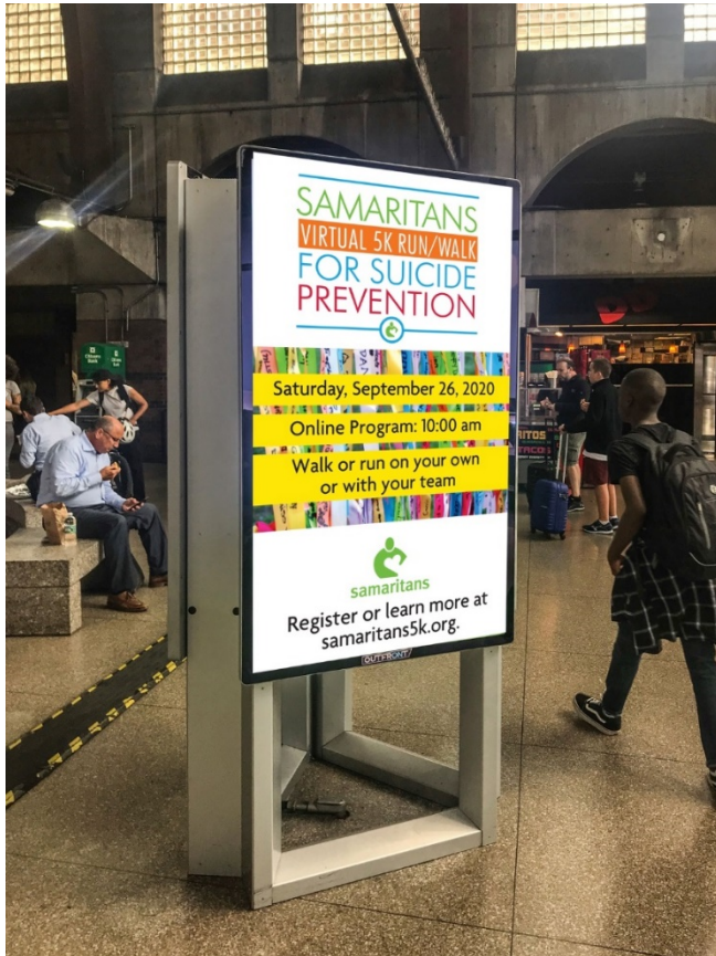
Supporting the Samaritans 5K with In-Station Digital Displays