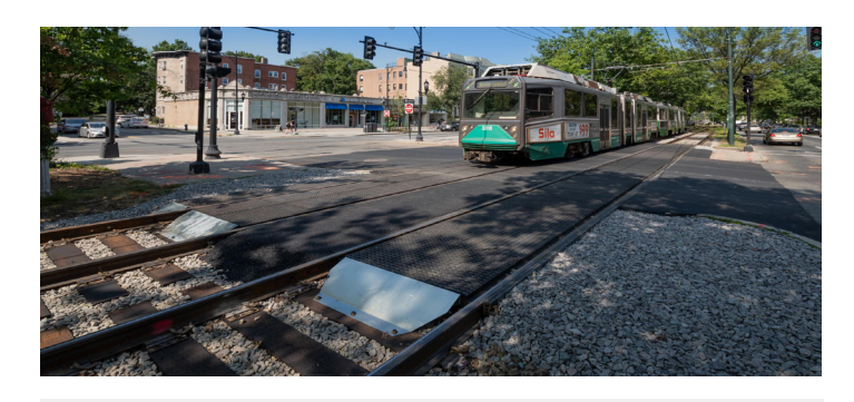
Rubber panel roadway crossing at Carlton Street (Completed January 2019)