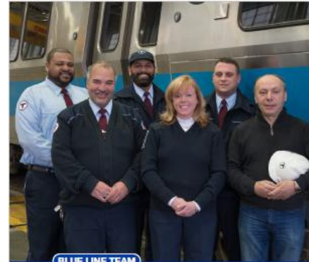
BLUE LINE TEAM

Transit Driver Appreciation Day March 16, 2018