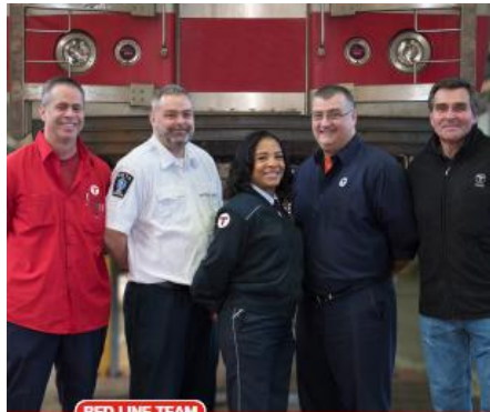
RED LINE TEAM

Transit Driver Appreciation Day March 16, 2018