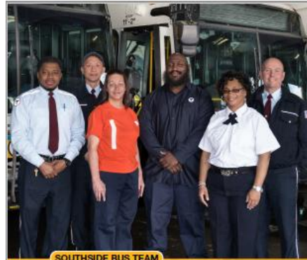
SOUTHSIDE BUS TEAM

Transit Driver Appreciation Day March 16, 2018