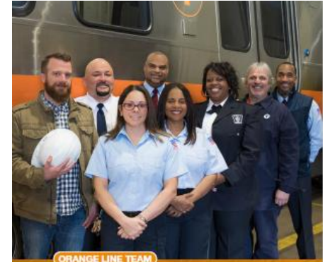
ORANGE LINE TEAM

Transit Driver Appreciation Day March 16, 2018